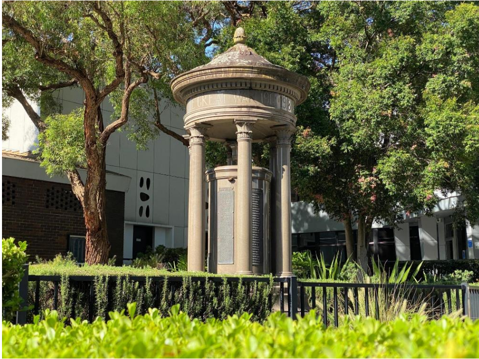
Drummoyne War Memorial