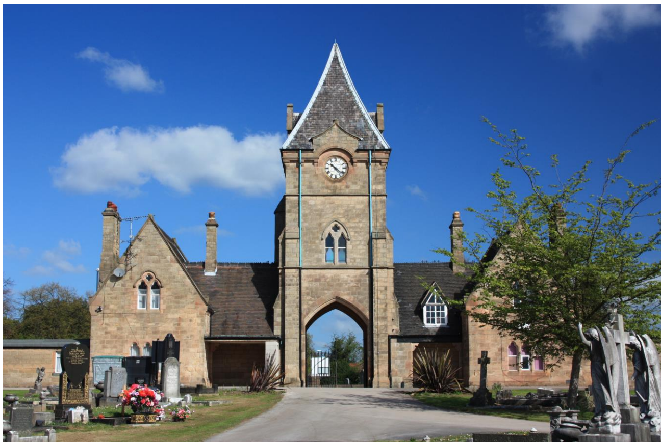
Nottingham Road Cemetery, Derby

Nottingham Road Cemetery, Derby contains 193 First World War burials and 134 from the Second World War. There is a small war graves plot of about 40 burials from both wars, the rest of the graves are scattered throughout the cemetery. (Information from CWGC)