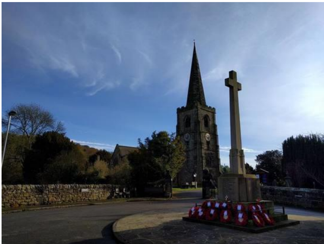
Duffield War Memorial Cross