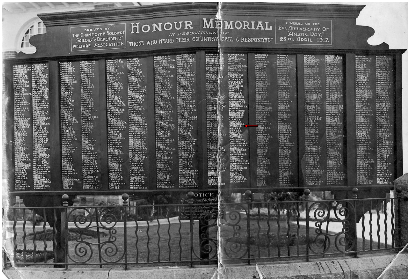
Earlier Memorial - Drummoyne Soldiers & Sailors Memorial